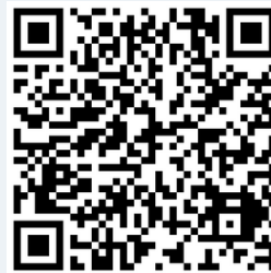
ABDA Website (Event details)